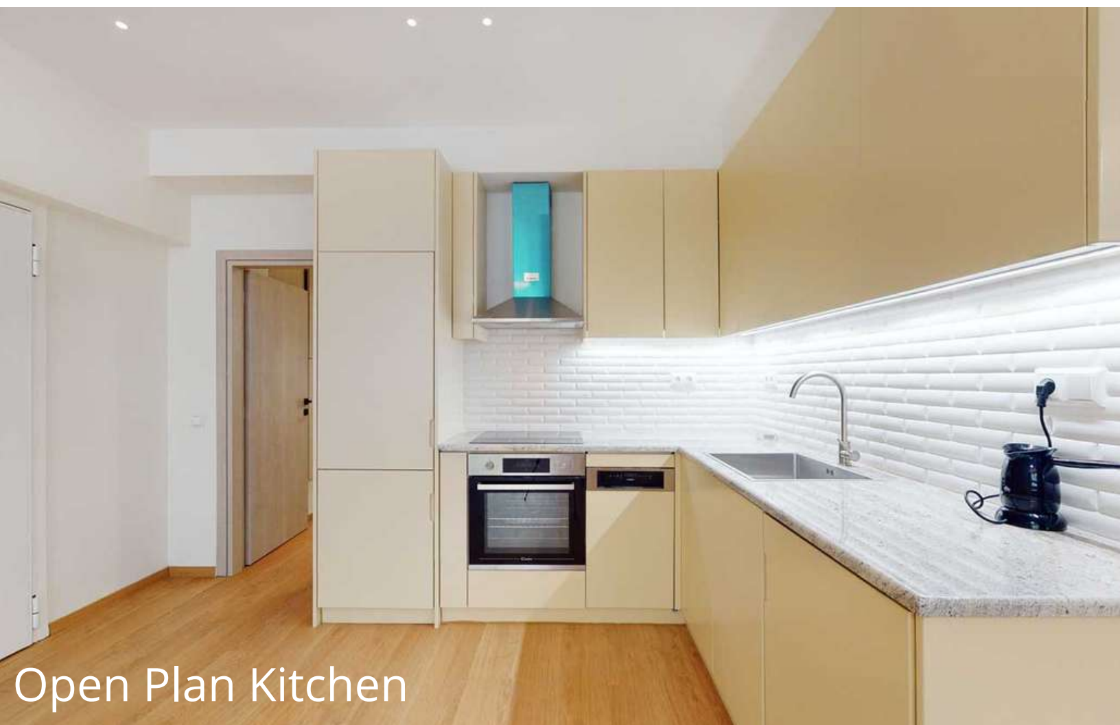
Open Plan Kitchen